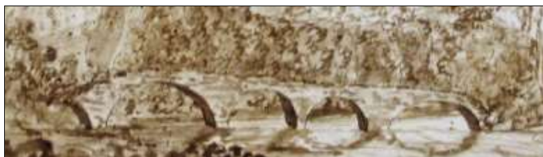
Figure 10. William Fox Strangways, Broken bridge over the Vara (detail of the bridge)

wooded hills and the deeply incised Vara Valley. The bridge has four surviving irregular arches and the remains of at least one additional arch are shown on the western end, which has completely collapsed. The bridge rises slightly towards the middle of the river as is characteristic of Ligurian bridges which have higher central arches to try and cope with floods (fig. 10). The Minuta di Campagna of c. 1820 (fig. 11) confirms that the bridge of Brugnato had collapsed at its western end and was impassable. Two proposals for the reconstruction of the bridge survive from the 1820s. The first includes a plan which shows the bridge in 1824 with a missing pillar indicated in red and two missing arches on the western end opposite the Franciscan convent 28 . The distance between the standing pillars is irregular, the two central pillars being closer to each other than the external ones. This characteristic is carefully shown by Strangways in his drawing which is evidence of his precision as an artist.