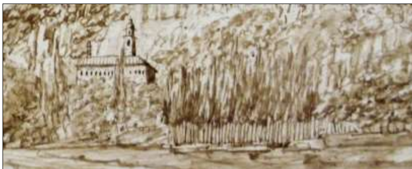
Figure 9. William Fox Strangways, Broken bridge over the Vara , detail of poplars along the Vara

The broken bridge of Brugnato is the principal subject of this drawing; its picturesque characteristics are emphasised by the context of hilltop villages,