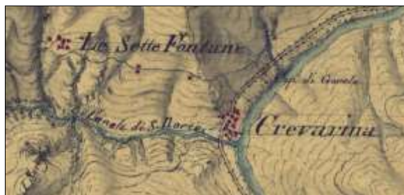
Figure 4. Corpo di Stato maggiore sardo, Ricognizioni eseguite alla scala di 1:20.000 che comprendano le due riviere degli ex-Stati sardi e parti delle attuali provincie di Alessandria e Pavia, 1827-1829, detail of Crevarina (sheet no. 86). Dai documenti originali archiviati presso le conservatorie storiche dell'Istituto Geografico Militare. (Autorizzazione n. 7005 in data 07/12/2018)