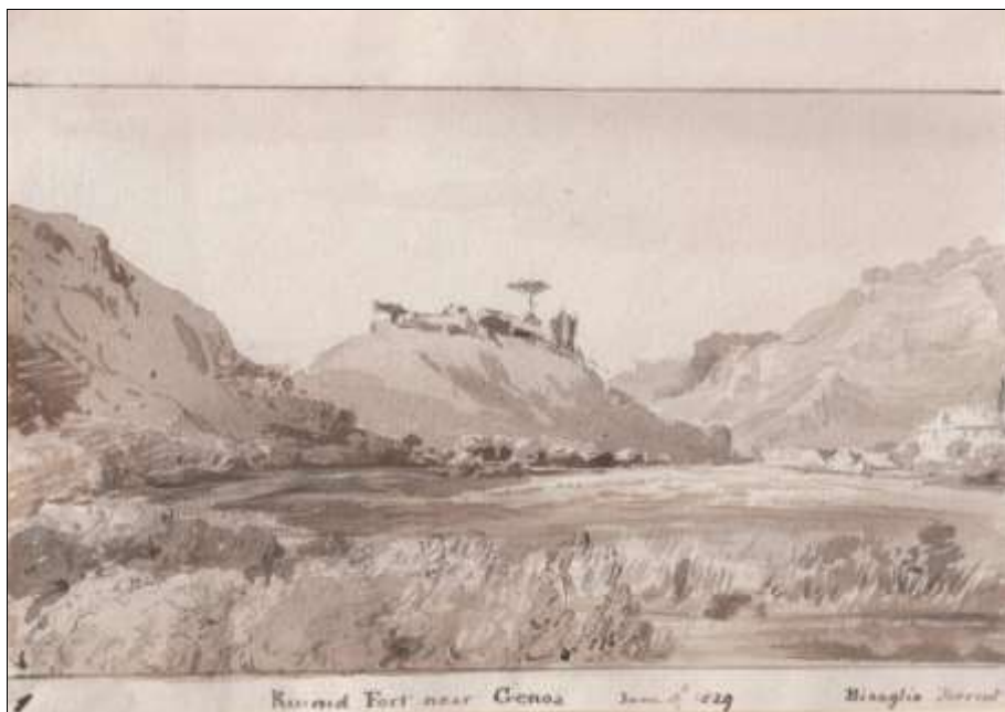
Figure 5. Elizabeth Fanshawe, 1 / Ruined Fort near Genoa June 3 d 1829 / Bisaglio Torrent, wash drawing on paper (116x169 mm, private collection)

indicated close to the Bisagno in contemporary military cartography 22 . The fort is not mentioned in Casalis' list of Genoese forts published in his Dizionario geografico storico statistico commerciale , nor in any nineteenth and twentieth-century publication on the Bisagno Valley and the history of forts in Genoa (CASALIS, 1834). While it was possible that a small fortification may have been built during the siege and pulled down after Fanshawe drew it in 1829, it is unreasonable to believe that no trace could survive in the historical record.