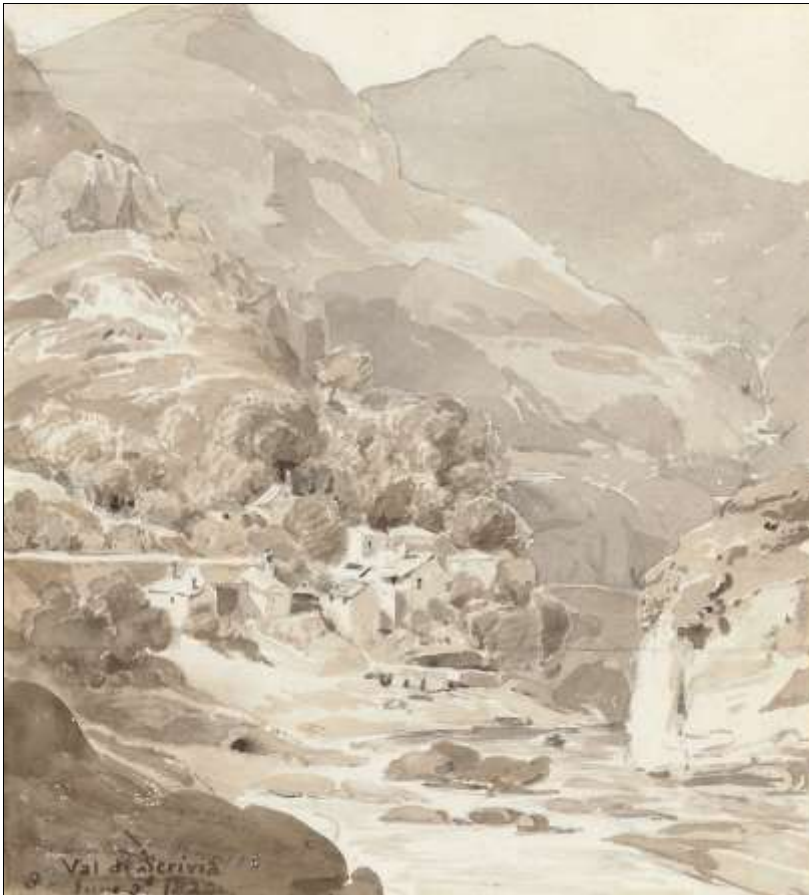
Figure 1. Elizabeth Fanshawe, June 3d 1829, wash drawing on paper (175×190 mm, private collection)

South to North 15 . The position of the shadows suggests that the drawing was made in the early evening which fits in with the timing of her journey. In the foreground lies the bed of the Scrivia River with several flat limestone rocks, and the steep and rocky right bank of the river, which is here at one of its narrowest and deepest stretches. This makes an ideal picturesque “station” from which to draw the village. One house is shown as being above the road, two are at the same level and six are in the section between the road and the Scrivia. Above the village there is a thick wood of broadleaved trees; the higher slopes appear to be clear of vegetation as are the two mountains in the background. This is the only known depiction of this small village and its surroundings before photography.