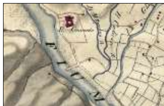
Figure 11. Corpo di Stato maggiore sardo, Riviera di Levante alla Quarta della Scala di Savoia ossia di 1 a 9450 , 1816-1827 (sc 1:9450, sheet 30, detail the broken bridge of Brugnato and the Convent). Dai documenti originali archiviati presso le conservatorie storiche dell'Istituto Geografico Militare. (Autorizzazione n. 7005 in data 07/12/2018)

The second proposal of 1828 gives a brief overview of the bridge's history and argued that it was crucial to the local road network as it was the only one in the Vara Valley between Cornice and the confluence with the Magra and formed an important link between the upper Vara Valley and Borghetto 29 . The report also pointed out that the bridge had been damaged by a recent flood, although no