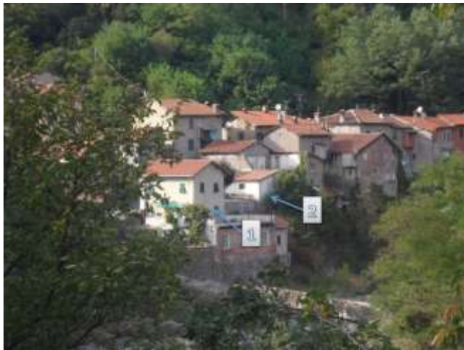
Figure 3. The houses of Creverina

fieldwork confirmed the precision and accuracy of her depiction (figs. 2-3). Local knowledge was crucial for the identification of the nine main buildings in the drawing and other landscape features of the area 16 . For example, building (1) survives and has been restored with a brick structure added below, but its former appearance corresponded to Fanshawe's drawing. On the ground floor there was a mill, in active use until c. 1915, which took water from the San Rocco torrent close to a locality called La Chiusa (the lock) using an elevated wooden canal which carried the water over the road, precisely where Elizabeth Fanshawe had drawn a straight white line, which could be the mill canal. Building (2) depicted by Fanshawe has been pulled down, but the local residents remembered that it existed and that it was a typical local Ligurian house with animals (horses in this case) kept on the ground floor, a family lived in the middle stories and hay was kept on the top floor, the driest room of the house.