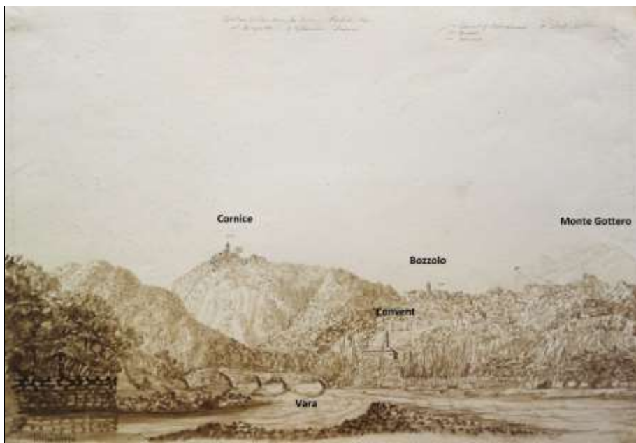
Figure 8. William Fox Strangways, Broken bridge over the Vara, Pont de Var, nr Borghetto in the Apennines (illegible) / V Convent of Franciscans / VV Bucola / VVV Cornicia / Distant mountains, wash drawing on paper (265x376 mm; Genova, Centro DocSai, coll. Topografica)

The crossing of the Magra continued to be very difficult for travellers, particularly in the Autumn and Winter months (BALZARETTI, PIANA, WATKINS, 2015). A topographical drawing by William Strangways shows the landscape of the stretch of the Vara Valley near the post-house of Borghetto (fig. 8). The view is not dated, but it was most probably made during Strangways' trip across Liguria in 1821 24 . The river occupies the foreground with its wide bed and in the centre there is a broken bridge, which also gives the title to the drawing. Near the bridge to the E, a church with a building is identified by Strangways as the «Convent of Franciscans» surrounded by mixed vegetation that includes a dense plantation or thicket. On the nearby mountains two villages are labelled by Strangways as «Cornicia» (left) and «Bucola» (right), which correspond to present-day Cornice and Bozzolo.