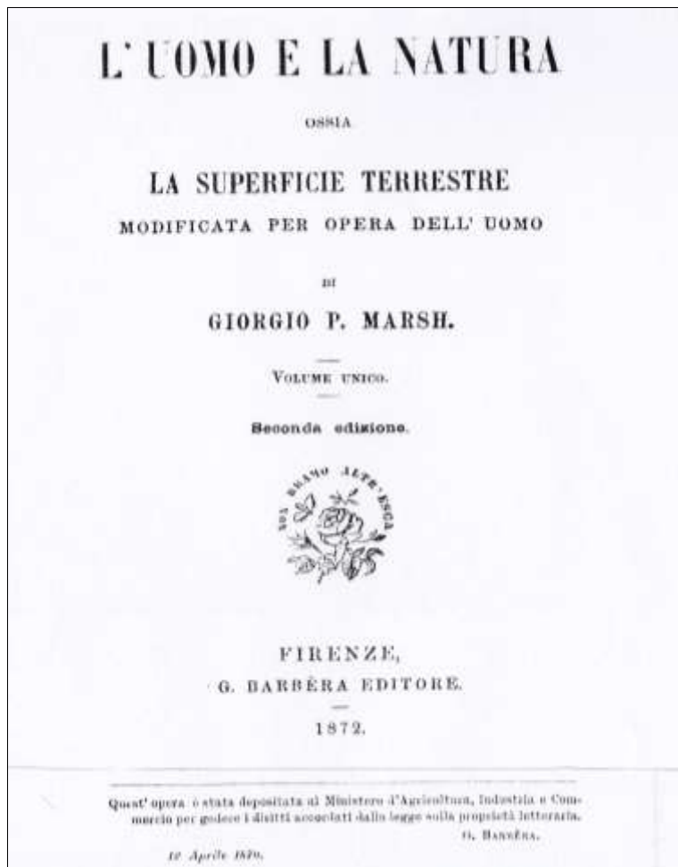
Figure 7. The front page of the Italian edition of Man and Nature . Its printing finished in January 1870. A reprint followed in 1872, still by the G. Barbèra, Publishing House of Florence Human pressure on nature, deforestation, environmental problems in Italy

It should be noted that in Italy Marsh's book certainly had a less wide circulation and an audience less large than that in the United States (as well as in England and France), and especially after his death, even if his remarkable personality and his participation to the Italian scientific milieu continued to be remembered for a certain period of time.