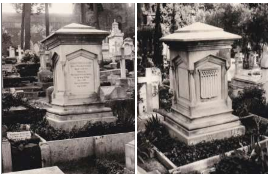
Figure 9. The Non-Catholic Cemetery in Rome: George Perkins Marsh's monument