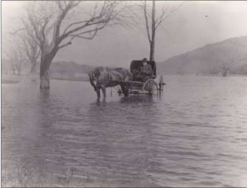
Figure 5. Overflowing of rivers in Vermont at the time of George Perkins Marsh: one of the effects of radical and extensive deforestation of the mountains of the region. This became one of the important topics of his research and of Man and Nature

In fact, the preparation of Man and Nature began in 1860 but the writing process was intertwined with that of Origin and History of the English Language, and of the Early Literature it Embodies , that was completed in Turin in the spring of 1862. The first draft of Man and Nature would be completed in April 1863, then revised and completed during the summer and the autumn of the same year. The work was, therefore, at a very advanced stage when, still in the spring of 1863, the Marsh family transfers once again and this time to a small locality close to Turin, a city that had become very crowded in its role of the capital as well as very expensive for the moderate salary of a diplomat – as Minister Marsh – at the time.