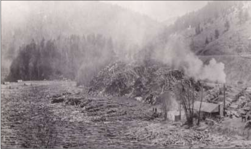
Figure 3. Drastic, reckless deforestation in Vermont – the State of George Perkins Marsh’s origin – in the second half of the Nineteenth century. It is the dramatic image of the ecological-environmental devastation that he had before his eyes from his youth, and that later constituted the fundamental core of his Man and Nature

pivotal centre not only of Man and Nature but also of researches that George Perkins Marsh would have performed in the Old Continent.