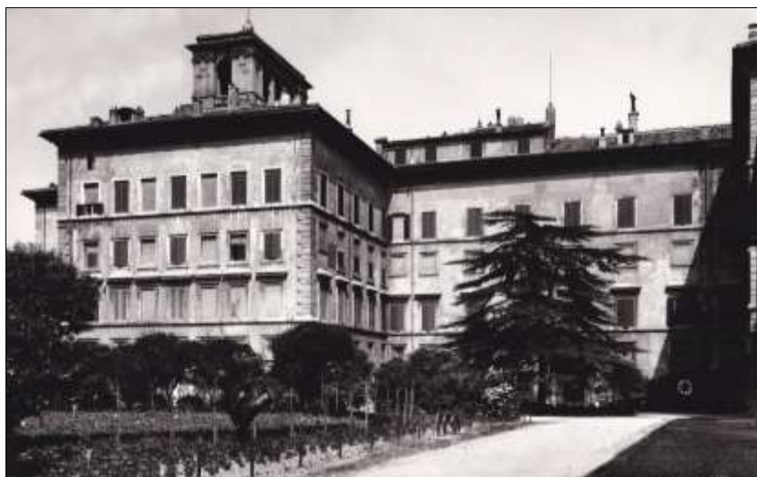
Figure 8. The historic palace of the noble Rospigliosi family located on the Quirinal hill

The residence of the Marshes was at first in a quarter on a small hill (today it is in the famous via Veneto’s area) and later on, in 1879, in the historic palace of the noble Rospigliosi family with a splendid view of Rome and a beautiful garden, located on the Quirinal hill, the tallest of the city’s hills, at few meters from the Quirinal Palace.