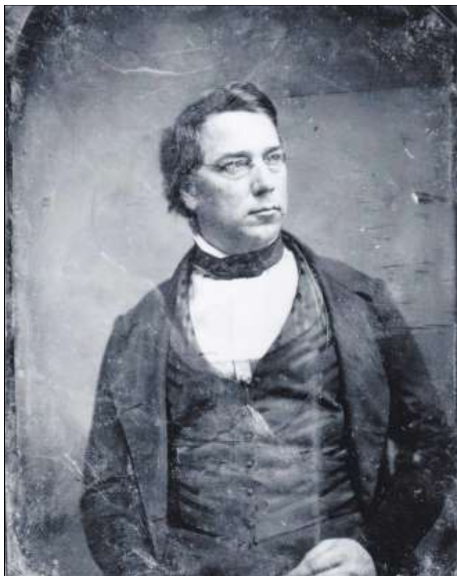
Figure 2. An artistic half-plate daguerreotype of George Perkins Marsh, gold toned, half-length portrait, head three-quarters to right, with spectacles, circa 1850, by Mathew Brady. George Perkins Marsh was elected as a Whig to the Twenty-eighth and to the three succeeding Congresses and served from March 1843 until his resignation in 1849, having been appointed by President Taylor as Minister Resident to Turkey. The picture presents him as United States Diplomat, the office he held from May 1849 to December 1853

themes also significant for his thought and for some of the subjects treated in Man and Nature .