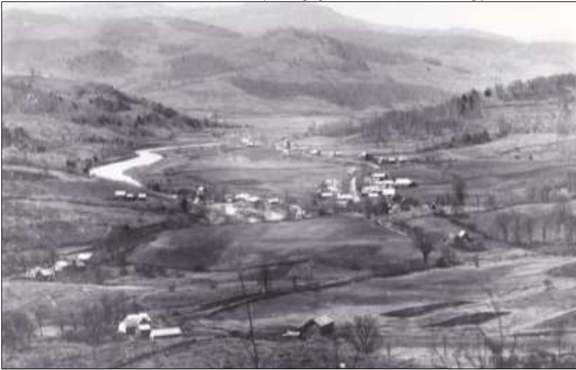
Figure 4. A view of Vermont in the Nineteenth century. Mountains and hills that were shrouded by dense forests now show a landscape extensively stripped of its original vegetal mantle, which remains only in spots that fail to resist the waters that rush down the slopes in the rainy seasons