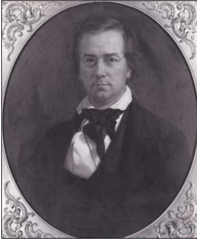
Figure 1. George Perkins Marsh in a portrait from circa 1845, by George Peter Alexander Healy. This renowned portraitist painted this oil on canvas while he was in Washington, D.C., where George Perkins Marsh was a Congressman elected as a Whig to the Twenty-eighth and to the three succeeding Congresses, serving from 1843 until 1849. In an unconstrained and forthright manner the Artist represents George Perkins Marsh, who became a lifelong friend, as an intellectual rather than a congressman, wearing a black cravat, fashionable at the time and a little ruffled, and highlights his intelligent and insightful gaze